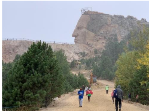
Doing the walk on a wide trail—a little rainy that day.