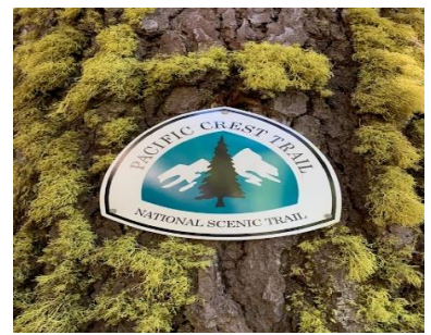
Pacific Crest Trail Segment on Mount Ashland Meadows Trail