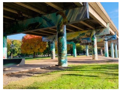
Medford Meander Medford