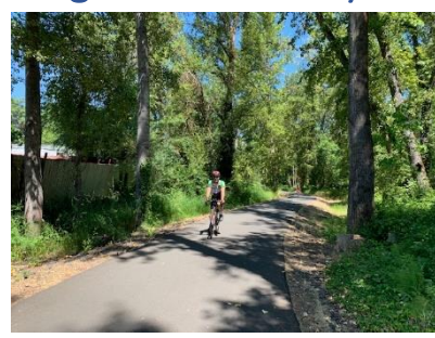
Bike Along Bear Creek Greenway