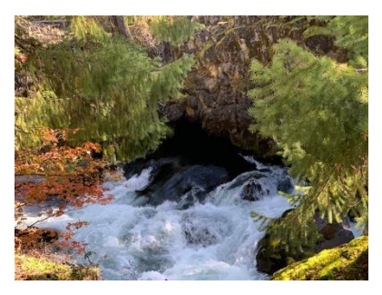
Wild and Scenic Rogue River Gorge

For more details contact: Tom Baltes, 505-298-1256