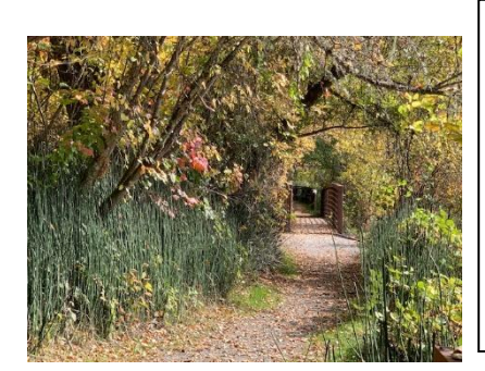
Casey State Park Caper