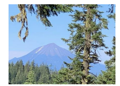
View of Mt McLaughlin from Grizzly Peak