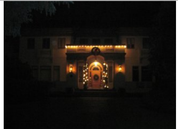
State Capitol Museum

AVA Sanction#/Distances: 101780. Walkers may chose either a 5K (3.1 miles) or 10K (6.2 miles) walk; both walks are rated 1A.