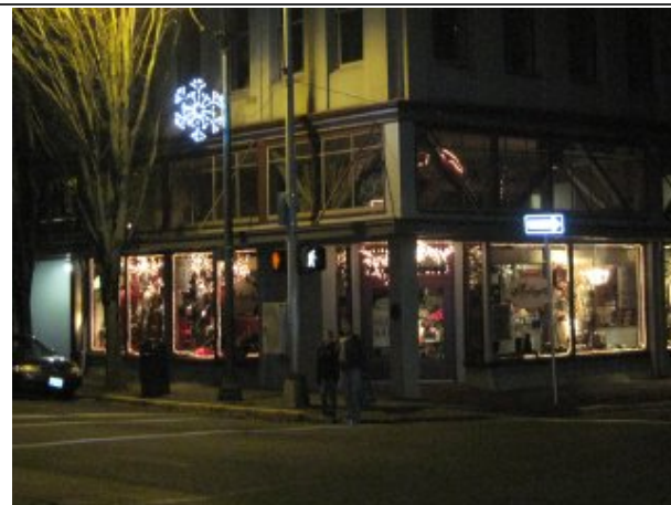
Fourth and Capitol Way

Facilities/Pets: Restrooms and water will be available at the start and finish and at the checkpoint. Coffee and cookies will be available at the checkpoint. Pets are permitted but NOT in buildings. Owners must observe leash and clean up laws.