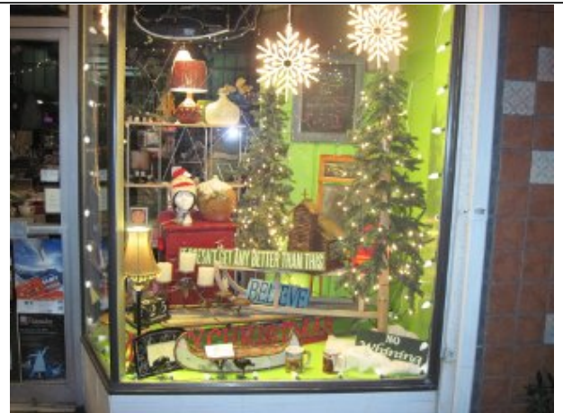
Way Too Much Cool Stuff

Description: Walk through the historic South Capitol Neighborhood, across the Capitol Campus, around Capitol Lake, along the waterfront, and through downtown Olympia beneath lighted street trees. The lighted ship parade starts at 6 PM, and is best viewed from the waterfront.