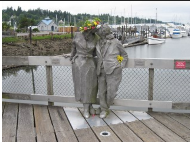
The Kiss at Percival Landing