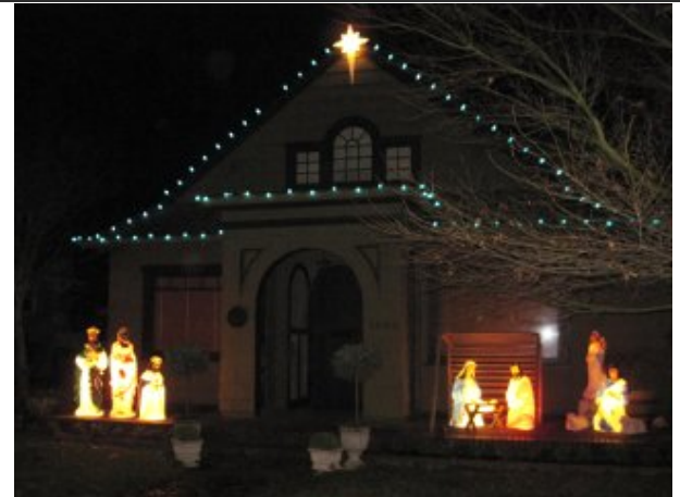
Capitol Way House