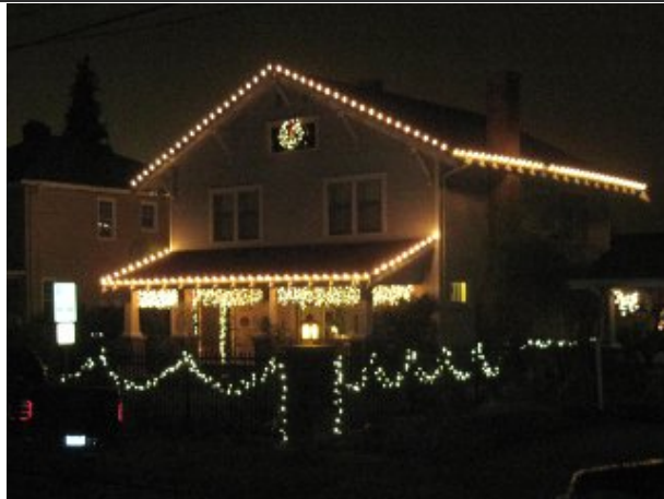
South Capitol Neighborhood