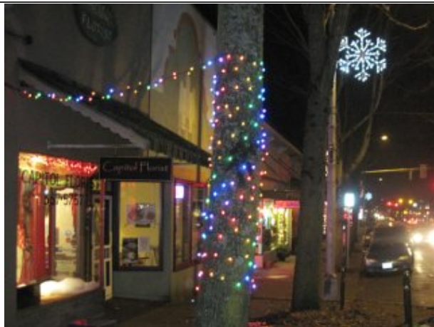
Very Tall People Beware!