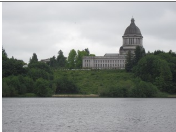
Capitol Lake and the State Capitol