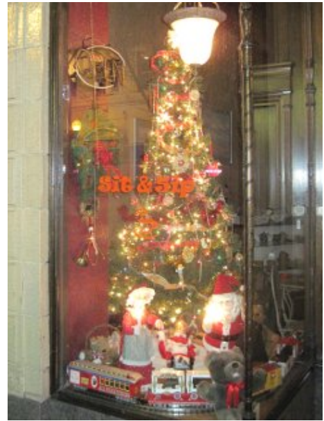
Fourth Avenue Shop