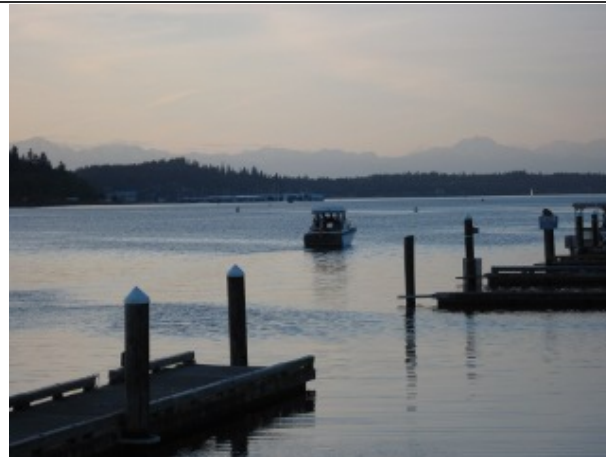
Olympia Waterfront and The Olympics