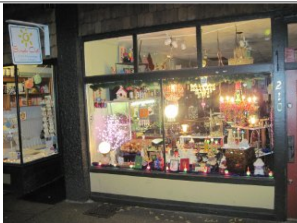
Everything You Ever Wanted?